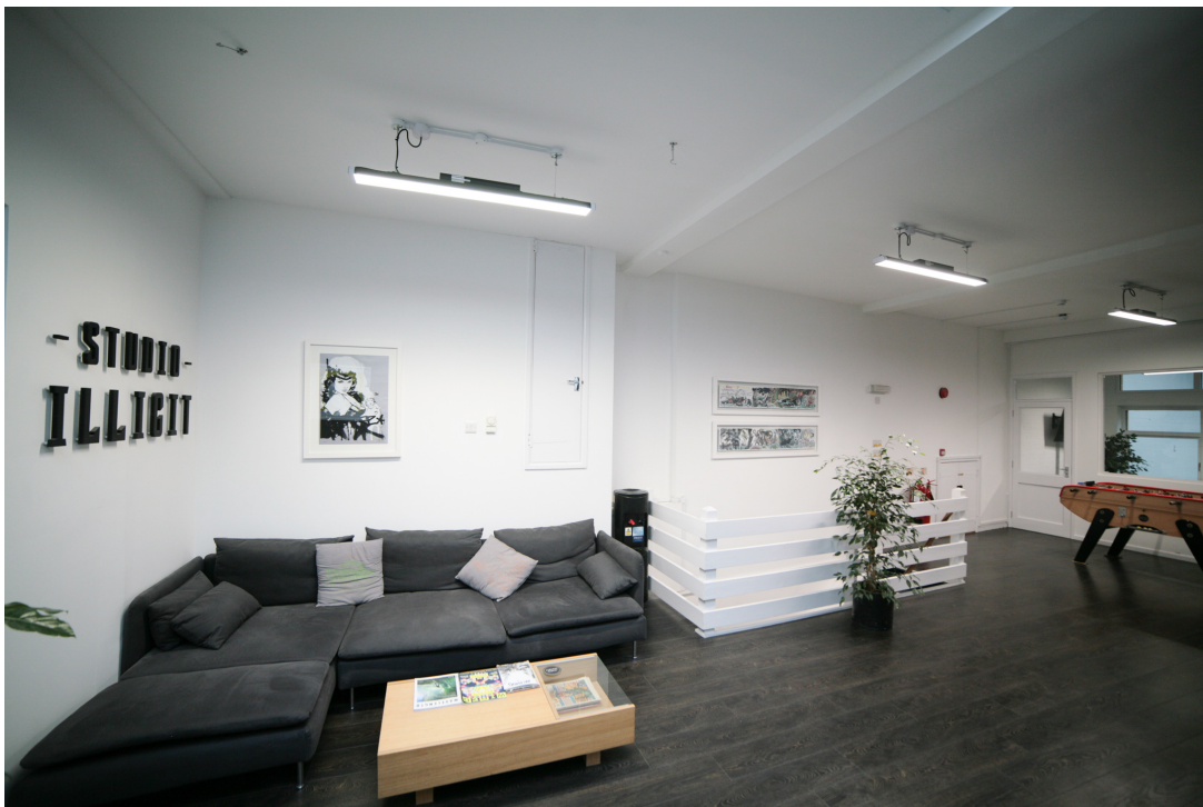
Break out area

The McCoy's is on the North side of Fore Street, near the junction with Bartholomew Street & West Street. This historic area called the 'West Quarter' is known for its individual retailers which include Fashion/Designer/Retro-Clothing, Music, Musical Instruments, Arts & Crafts, Games, & Gifts. Pubs, Restaurants & the Picture House, complete a lively and varied street scene.