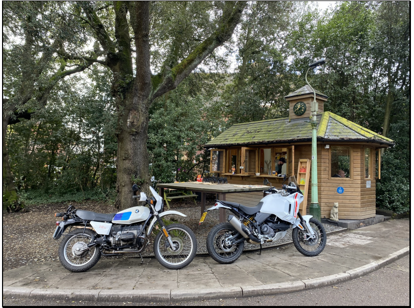
Coffee & gate hut

Barnfield Crescent is a prestigious private crescent running off Southernhay East, Exeter's prime central business district. In a few minutes' walk is not only the city's High Street and the 400,000 sq ft Princesshay Shopping Scheme. Also within easy walking distance are the Central main line railway station and the bus and coach stations. Despite its central location and accessibility Barnfield Crescent retains a rare degree of tranquility and 'exclusivity'. Fresh brewed coffee available on site too