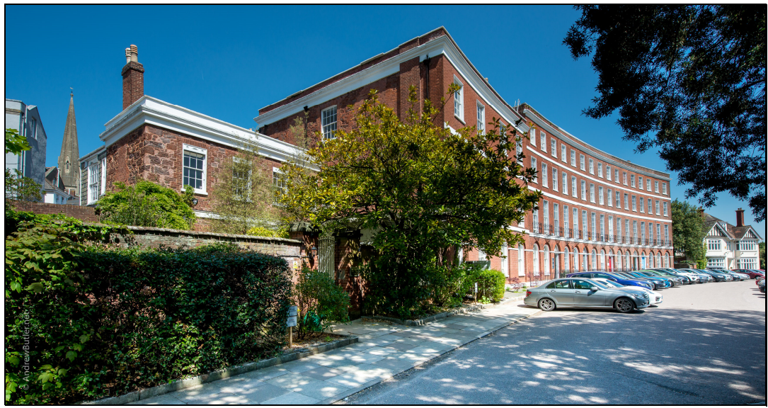
Lodge & Crescent